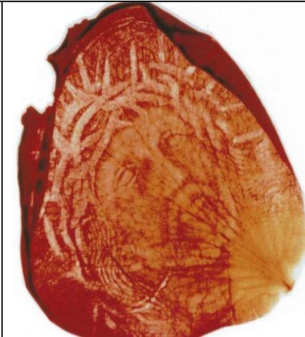
The Rose Petal