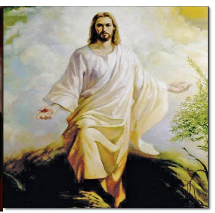
With the approaching Passion, Death and Resurrection of Jesus in this quarter, this Supplement is Part Two of Jesus & His Shepherds. It begins with the Shepherds during the Passion and culminates at the Ascension.