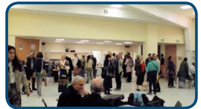
People who attended the 3 th Valtorta meeting Day had the opportunity to meet with the conference speakers.