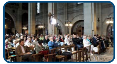
A great number of people attended the 3 th Valtorta meeting, listening with interest to the speakers reports, which took place inside Notre Dame d'Auteuil in Paris.

A free Maria Valtorta Foundation's Newsletter is available by filling your information, clicking down below: www.fondazionemariavaltorta.it/it/multimedia_newsletter.php