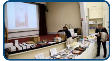
A bookstore was set up in a near by parish area where various editorial initiatives have attracted a good number of visitors besides Maria Valtorta's readers.